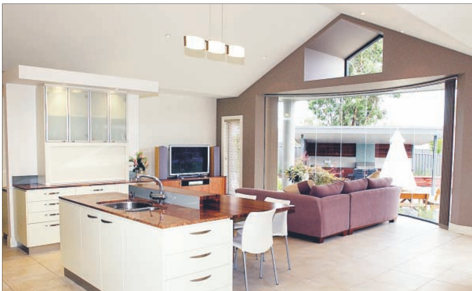
Form and function: The Master Builders Home of the Year combines modern lines with a wheelchair-friendly layout and design.

Each year, the MBA holds an awards ceremony, dedicated to recognising outstanding work and practices.