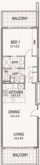
One Bedroom Apartment 66.8m 2 of living