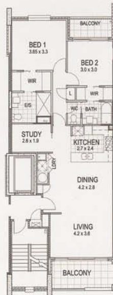
Two Bedroom + Study Apartment 94.7m 2 of living