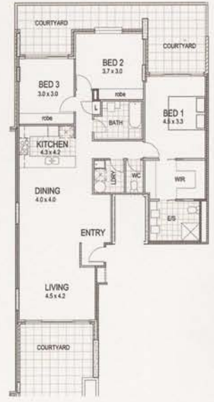
Three Bedroom Apartment 128.5-133m 2 of living