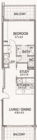
One Bedroom + Study Apartment 66.8m 2 of living